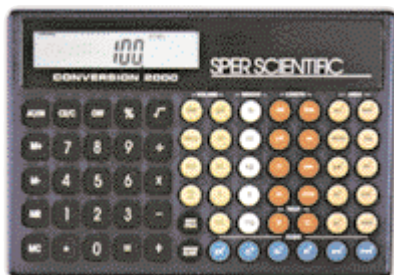
Dim: 5 3/8 x 3 5/8 x 1/2 in. Wgt: 3.7 oz.