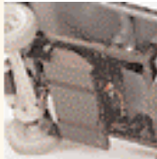
Heavy Duty Design