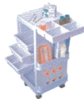
Dim. (HxWxD) (in.): 32 3/4 x 17 x 15 1/2 Drawers (LxWxD) (in.): 14 1/4 x 10 3/8 x 2 7/8